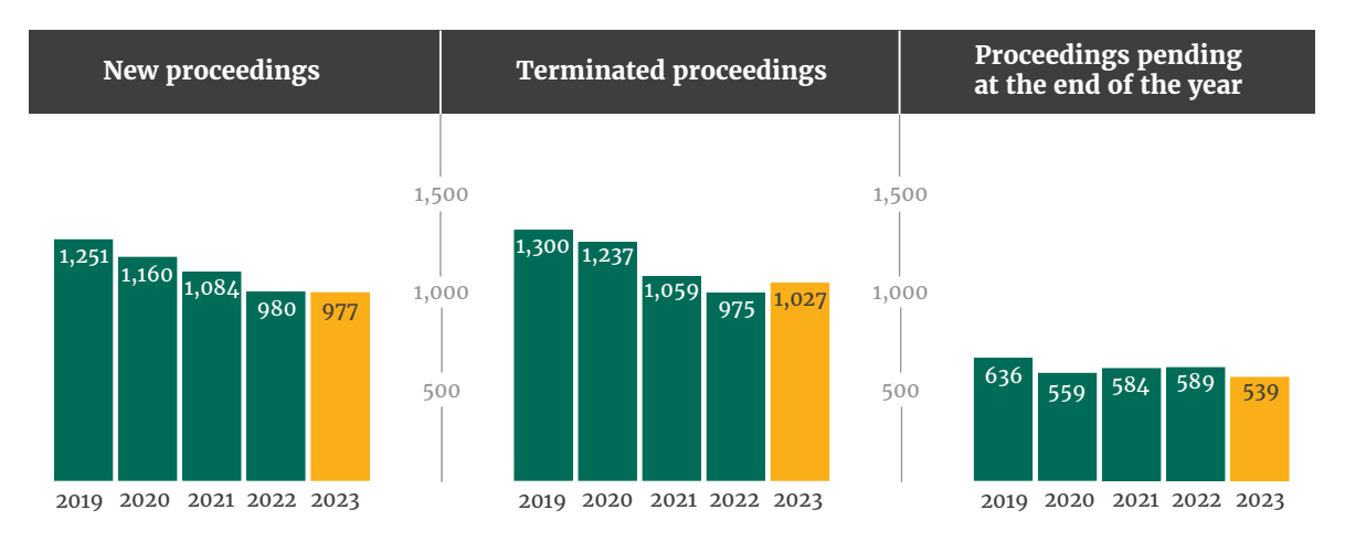
General overview of the new, terminated and pending proceedings from 2019 to 2023

The caseload and the number of terminated proceedings over the last five years can be read in detail from the following comparative overview: