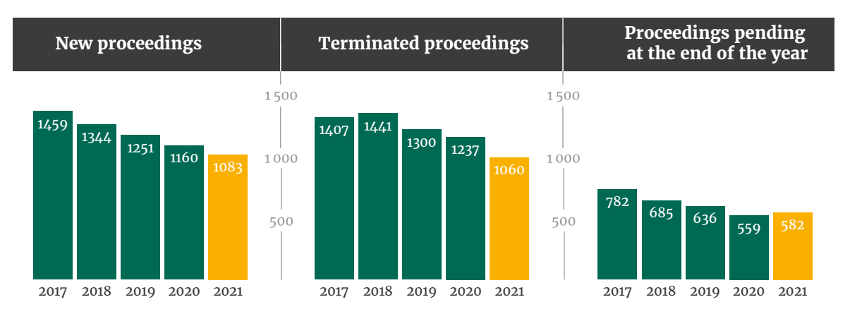
General overview of the new, terminated and pending proceedings from 2017 to 2021

The caseload and the number of terminated proceedings over the last five years can be read in detail from the following comparative overview: